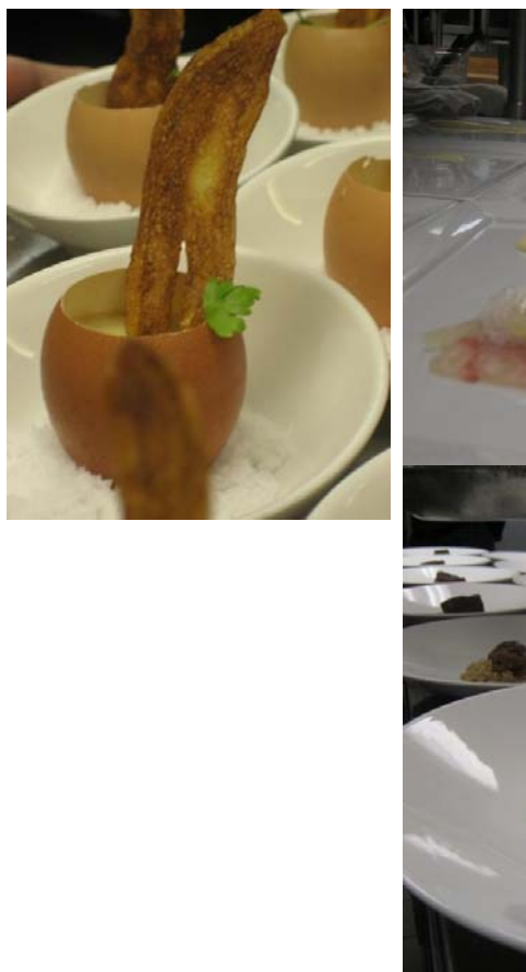
Custard with Fingerling Potato ( top left ), Kona Kampachi, Celery Root, Green Apple and White Miso ( top right ), Dopplebock Braised Beef Shortrib, Barley Risotto and Pickled Garlic ( bottom left ), Dark Chocolate Tourchon, Butternut Squash and Pine Nut Butter ( bottom right )

Join our Facebook group to find out the latest about news and events